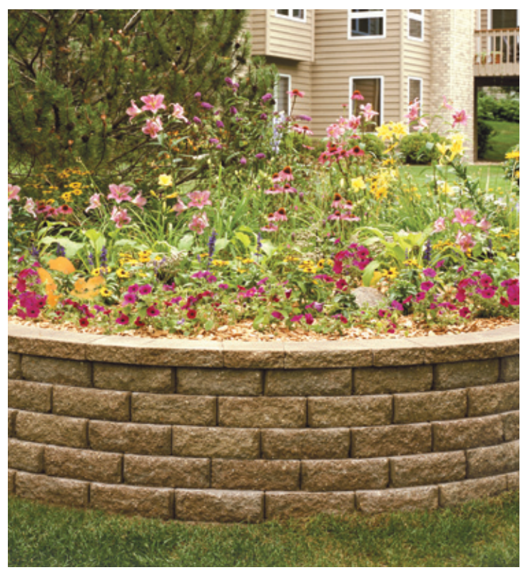
See anchorwall.com for installation instructions.

Anchor Wall Systems, Inc., 5959 Baker Road, Suite 390, Minnetonka, MN 55345. A&B0810 72.3040.1 08/11 4015